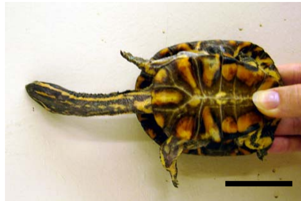
Figure 1. Ventral view of juvenile H. tectifera collected at the municipality of Ritápolis, Minas Gerais state (scale bar = 5 cm).

On 26 July 2006, one juvenile of H. tectifera (Figure 1-2) (carapace length = 112.4 mm, body mass = 165 g) was hand-captured, photographed and released in the Ritápolis (21°00'02.42" S, 44°18'16.09" W, 1051 m above sea level), southeast of state of Minas Gerais, Brazil, inside in the cerrado biome.