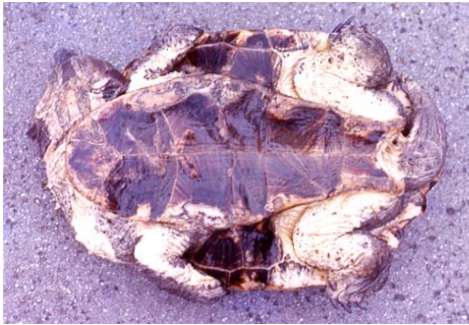
Figure 2. Chelus fimbriatus from Leticia, Colombia.

both German and Latin, utilized the forms Chelus (in Latin) and Chelys (in the German text), and confusion over which spelling should be considered valid prevailed for a long time, with the Chelys defenders generally prevailing until Zug (1977) finally re-examined and analyzed Duméril's original text.