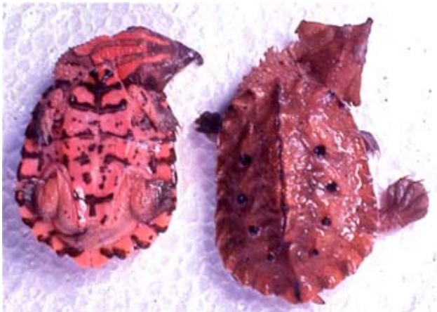
Figure 3. Hatchlings of Chelus fimbriatus from the Amazon population (note stripes under neck and plastral markings.

Other scientific names that have been proposed for the matamata (listed by Pritchard and Trebbau 1984, and Fritz and Havas 2006) are based upon misspellings or casual recombinant forms. Merrem (1820) used Matamata as a generic name.