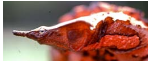
Figure 4. Heads of Chelus fimbriatus.