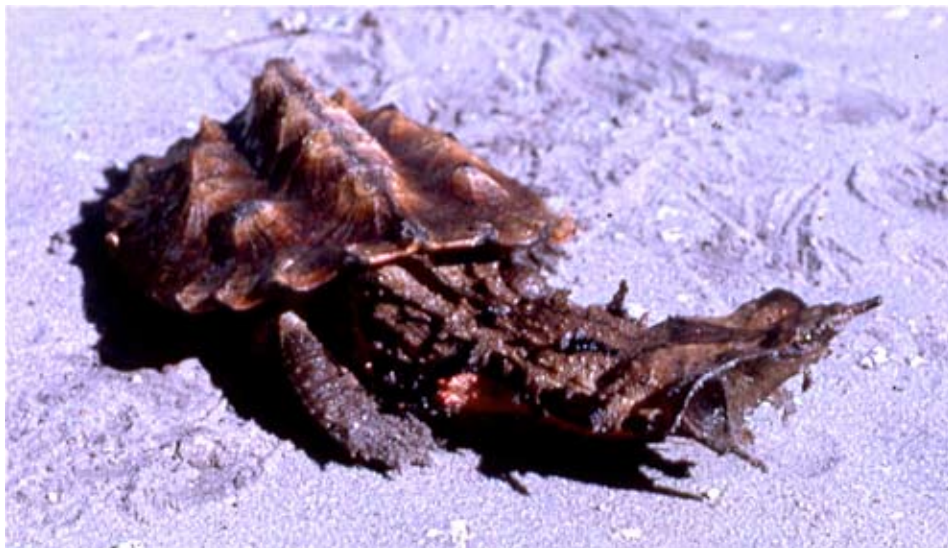
Figure 1. Chelus fimbriatus from the Amazon basin in South America.

subsequently invalidated by Opinion 660 of the ICZN (International Commission on Zoological Nomenclature 1963). The same opinion established Testudo fimbriata Schneider 1783, as the valid name, an epithet that pre-dated the alternative names Testudo matamata Bruguière 1792 and Testudo bispinosa Daudin 1801. The species was transferred to the new genus Chelus by Duméril (1806). This publication, in