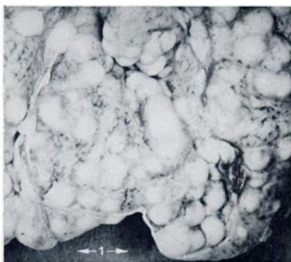
FIGURE 1. Multiple white nodules in the liver (scale in cm).

Epithelium was intact in the nodule from the webbing of the forefoot, but the dermis contained sheets of epithelioid cells interspersed with foci of fibrin and necrosis (Fig. 3).